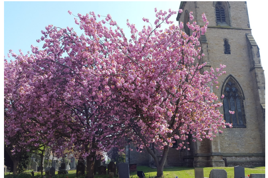
Full Blossom in the Churchyard

The village magazine of North Ferriby from All Saints' Church